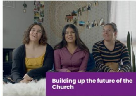
Building up the future of the Church

The Christmas Joy Offering has been a cherished Presbyterian tradition since the 1930s. The Offering distributes gifts equally to the Assistance Program of the Board of Pensions and to Presbyterian-related schools and colleges equipping communities of color. The Assistance Program provides critical financial support to church workers and their families. Presbyterian-related schools and colleges provide education and leadership development while nurturing racial and ethnic heritage.