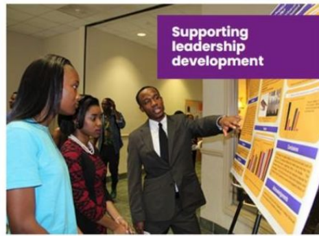
Supporting leadership development