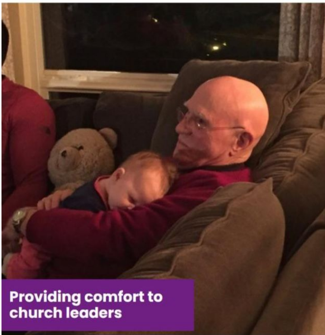
Providing comfort to church leaders