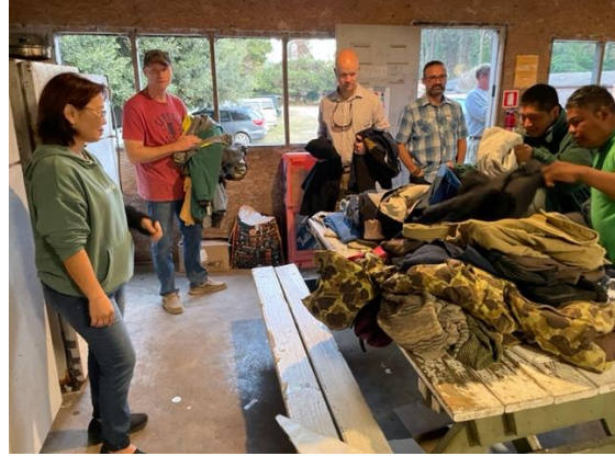
Men's Winter Clothing Community Outreach Mission to Johns Island last week