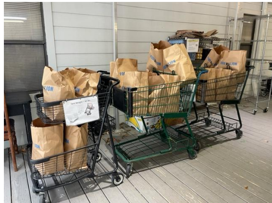
James Island Outreach Thanksgiving bags