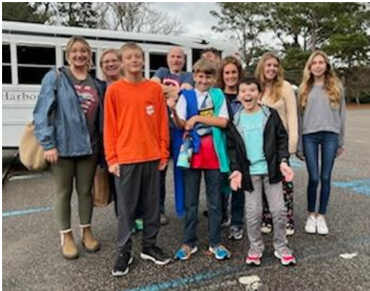
YOUTH at the Festival of Lights!